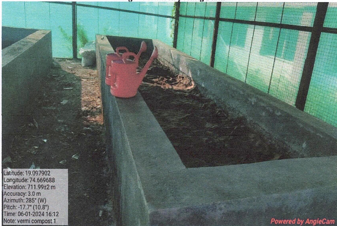
Image: Vermicomposting Plant

Latitude: 19.097902 Longitude: 74.669688 Elevation: 711.99±2 m Accuracy: 3.0 m Azimuth: 285° (W) Pitch: -17.7° (10.8°) Time: 06-01-2024 16:12 Note: vermi compost 1